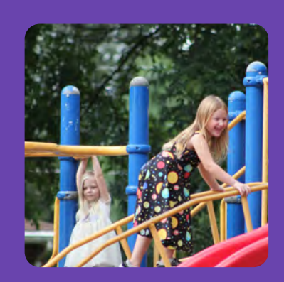
Kindergarten (Full day only)

Prekindergarten is focused on preparing students for kindergarten through literacy study, pattern building, and hands on learning. Students deepen academic skills needed to succeed in kindergarten and study God's word.