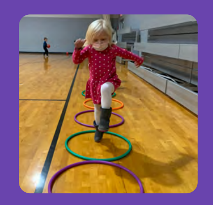
Prekindergarten (4 year olds)

Our preschool program prepares students for confidence in school settings and how to interact with others. Students develop fine and gross motor skills, identify letters, numbers, and patterns, and worship Jesus daily!