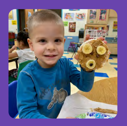
Preschool (3 year olds)

Springfield Lutheran School understands that early childhood is an important period in which children develop cognitive skills and build a foundation for reading, writing, and mathematics. Our early childhood program is committed to providing hands-on learning experiences in a positive environment. Our program allows children to develop character skills, social/emotional growth, gross-motor skills and independent functioning. SLS teachers are dedicated to helping children learn and grow at a developmentally appropriate pace. We provide a strong educational foundation in a safe, nurturing environment that honors God and develops young leaders. Preschool and pre-kindergarten students at SLS have the option to attend part or full-time. Part time options allow families to attend school from 8:00-11:30 Monday through Friday, or three full days of your choosing. Full time is Monday through Friday from 8:00 to 3:00.